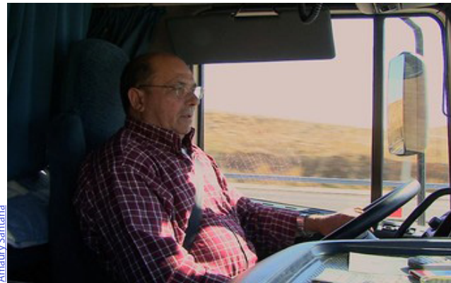
Life on wheels: long-haul truck driver in Spain